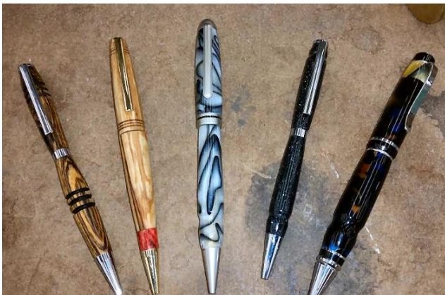
Day two of the Fine Writing Instrument class, completed five pens.