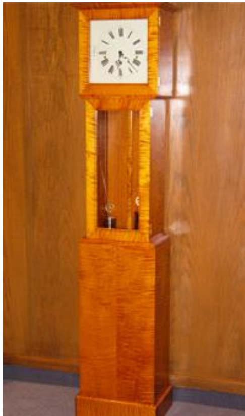
Making Curly Maple Pop

To some extent this happens naturally with any stain when you wipe off the excess. But you can significantly increase the darkness, or pop, by applying a number of coats of thinned water-soluble dye stain and sanding or scraping in between coats after each is dry.