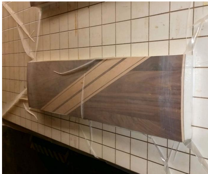
Vacuum Pressing the laminations together for Long board.