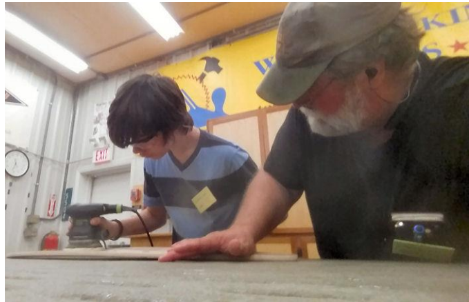
Grandson and I sanding the wood for his Long board.