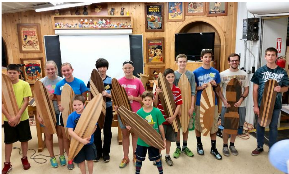
Group photo of the Skate board class, Proud owners of new skate boards, these children did great work on their boards.