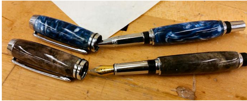
First Fountain pen, Barron style pens can be either fountain or roller ball.