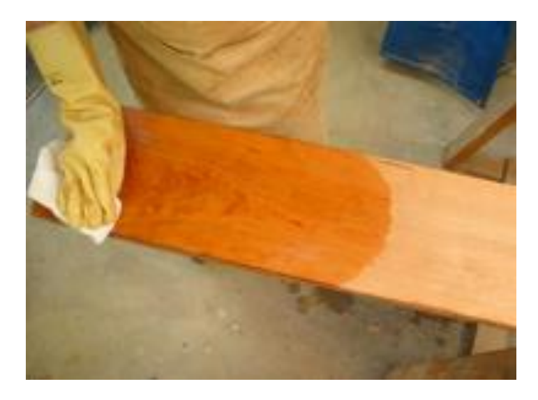
Wetting Cherry to Predict Blotching

You can usually get a pretty good idea whether or not the wood you are using will blotch when a stain or finish is applied by wetting the wood.