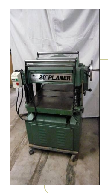
20" grizzly planer (new:$1500) $800

Call Howard Lund 312-519-4848 Or email info@metrichome.com