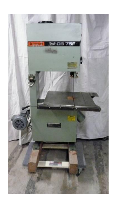
Re Saw, Hitachi CB75F: (new $3500)