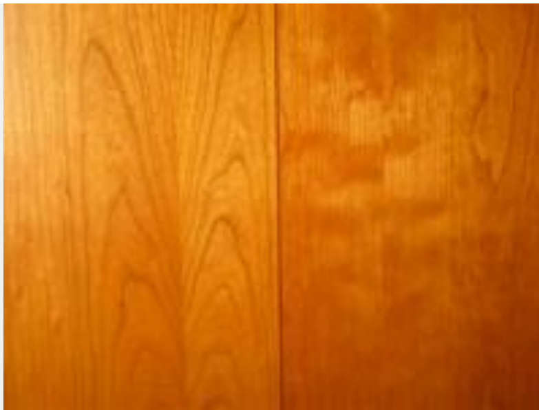
Non-Blotchy & Blotchy Cherry

Cherry is a beautiful wood that is easy to work. But it is a problematic wood to finish because it has a tendency to blotch, even with just a finish applied—no stain.