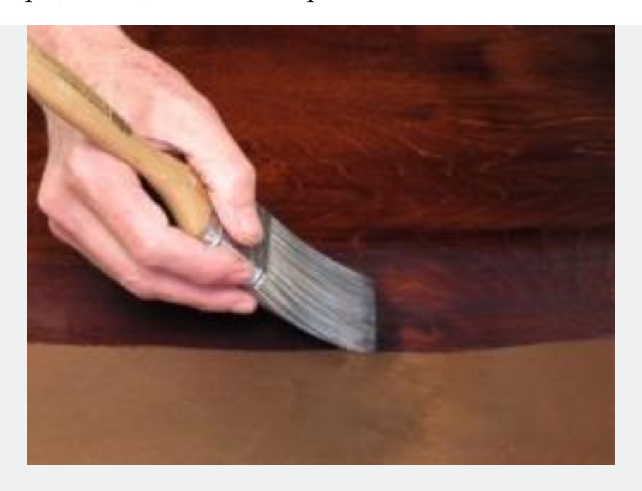
Water Soluble Dye Streaking

If you are brushing a water-based finish over a water-soluble dye, you should be aware that the finish can dissolve the dye and the brush will pick it up and cause streaks. To keep this from happening, seal the wood first with another finish that doesn't contain water—for example, shellac, varnish or lacquer.