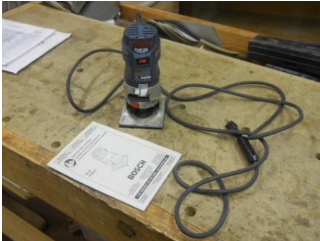
Bosch Colt Palm Router Model # PR20EVS $60.00