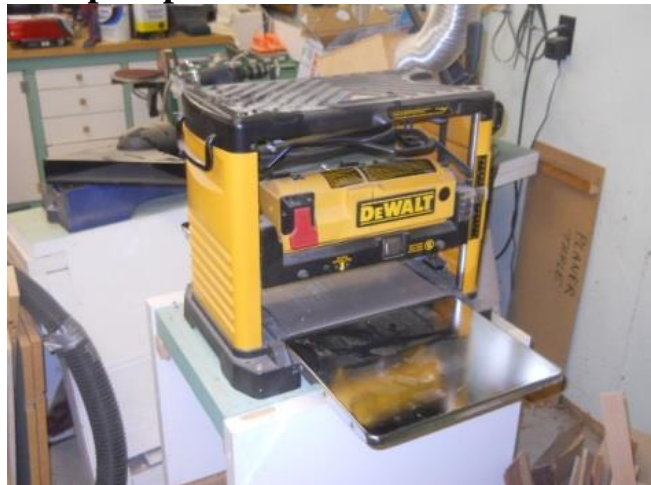
DeWALT Planner Model # DW 733 $150.00