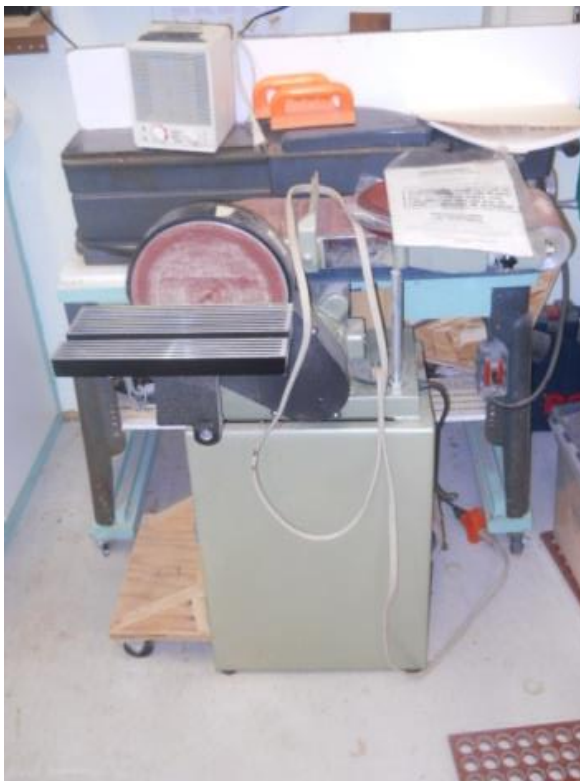
Floor Standing 6" Belt / 9" Disc Sander Central Machine $125.00