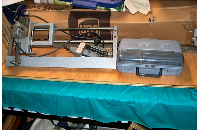
Small lathe $200