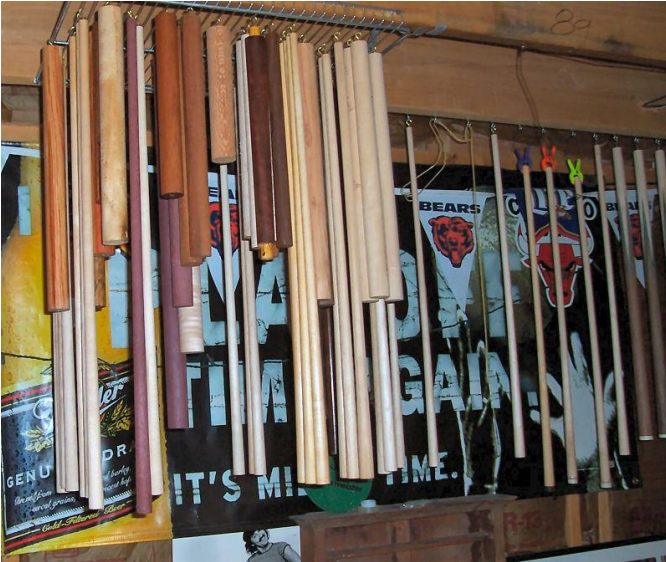
Stock of pool cue blanks call for price