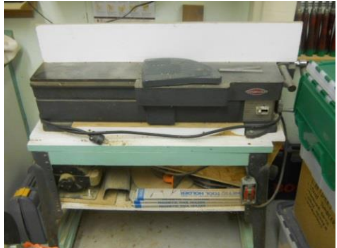
Craftsman 6" Joiner on stand $150.00