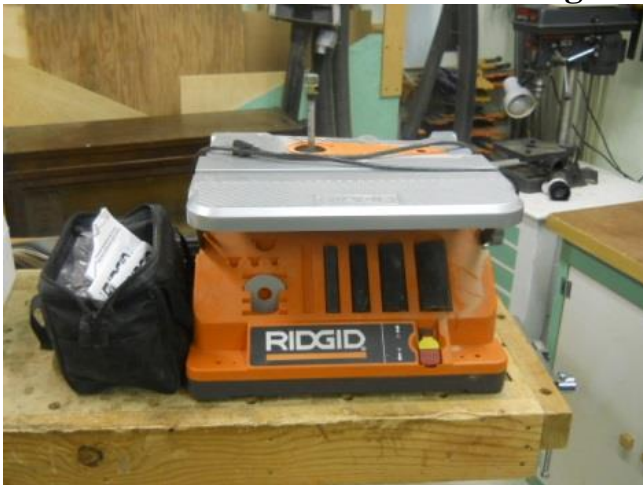
Ridgid Oscillating Edge Belt Sander Model # EB4424 $100.00

These are items that belonged to our past president Lou Takacs