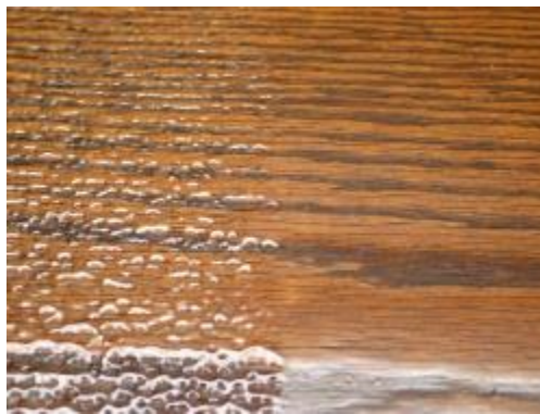
Shellac & Fish Eye

All finishes are susceptible to fish eye if the silicone contamination is great enough. But for most situations shellac isn't affected by the silicone. A coat of shellac will block the silicone so another finish can be applied on top without a problem.