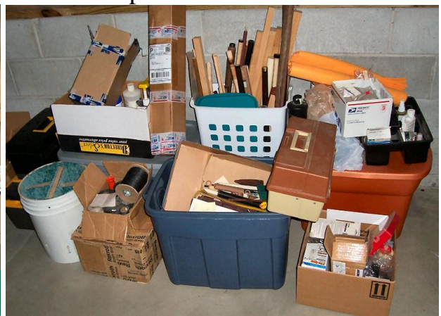
Stock of pool cue blanks call for price