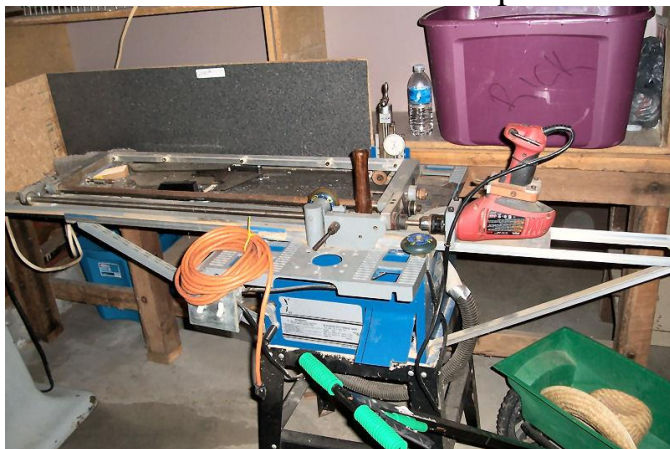
Small Table Saw $200