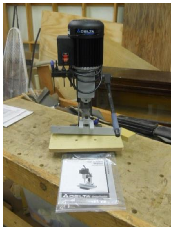
Delta Hollow Chisel Mortiser Model # MM300 $100.00

Anyone interested in any of the above items can call Pam Takacs at 219-241-0973