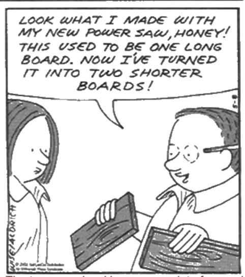
The term woodworking covers a lot of ground

A scrawny little carpenter is sitting at the bar having a beer, a big burly goof walks in and WHACK, smacks the little carpenter on the ear knocking him off his stool.