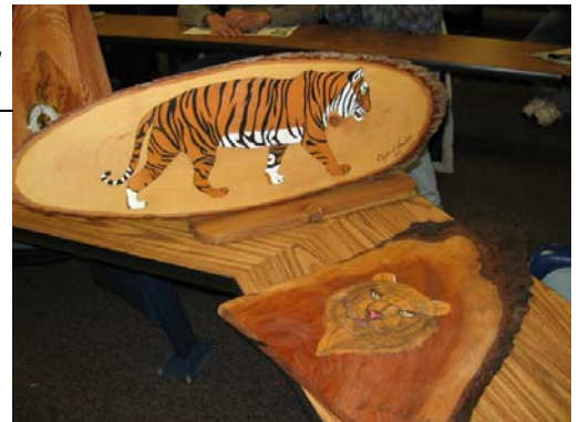
Clyde C Hewlitt