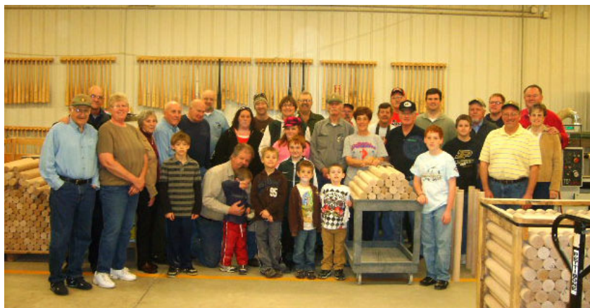
Thirty-four of the club members and family attended the field trip to Hoosier Bat in Valparaiso